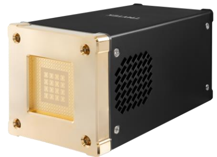
Figure 1. BBox™ One 5G 28 GHz