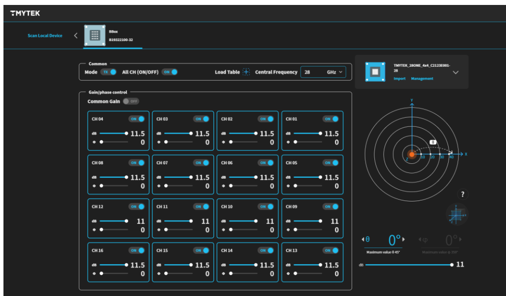
Figure 3. TMXLAB Kit – Software GUI for controlling BBox™ One

The BBox™ One software interface offers both UI and API control which are completely designed in house by our software team. Our patented software algorithm offers better accuracy and easier control on the beam angles. The module can be controlled either by RJ-45 ethernet cable or USB cable. Both the UI and API are available for our customers to access and download from the Web. The user interface shows the 16-channel phase and amplitude control block diagram as depicted below. To control the parameters, please drag the dB and \Phi slide bars on the desired channel to make the changes. The left portion of the interface shows the beam steering angle. This can be used together with our standard antenna kit to control the steering angle.