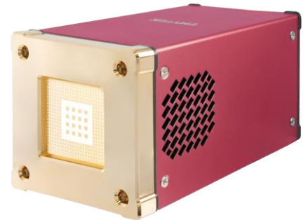
Figure 1. BBox™ One 5G 39 GHz