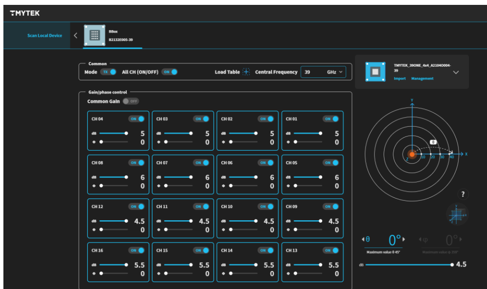
Figure 2. TMXLAB Kit – Software GUI for controlling BBox™ One

The BBox™ One software interface offers both UI and API control which are completely designed in house by our software team. Our patented software algorithm offers better accuracy and easier control on the beam angles. The module can be controlled either by RJ-45 ethernet cable or USB cable. Both the UI and API are available for our customers to access and download from the Web. The user interface shows the 16-channel phase and amplitude control block diagram as depicted below. To control the parameters, please drag the dB and \Phi slide bars on the desired channel to make the changes. The left portion of the interface shows the beam steering angle. This can be used together with our standard antenna kit to control the steering angle.